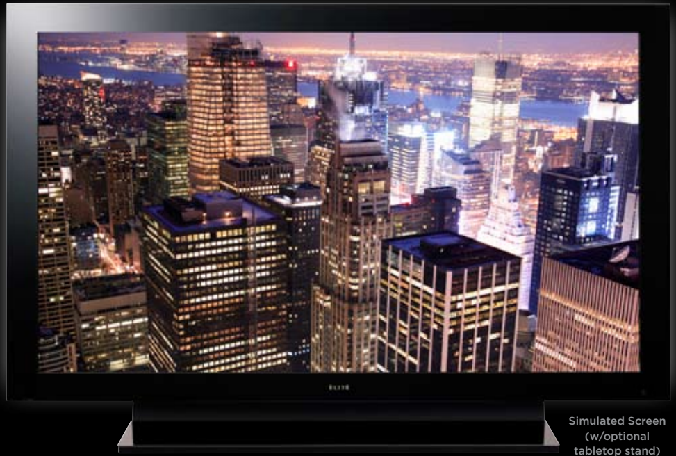
Simulated Screen (w/optional tabletop stand)

The Elite KURO signature series monitor represents the absolute pinnacle of Pioneer technology and craftsmanship. Meticulous attention to detail and pure unrivaled performance are just the beginning for custom installations. The signature series is the result of a special limited run created for the entertainment purist. This Elite KURO monitor was designed to excel in every way by providing extraordinary entertainment experiences for the most discerning of tastes.