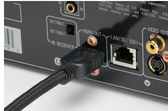
1 HDMI Output