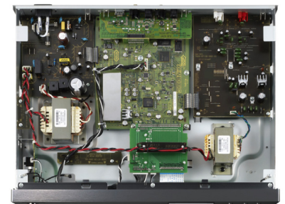
Superior Build Quality*

Specifications and design subject to modification without notice.