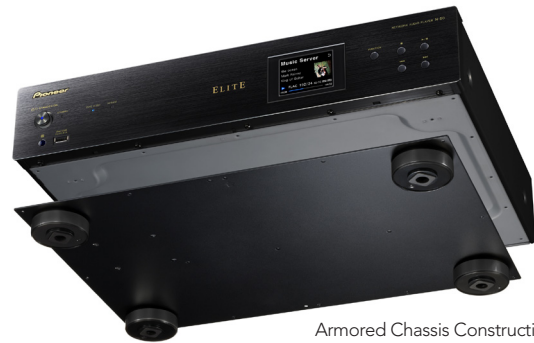
Armored Chassis Construction (16 lbs)